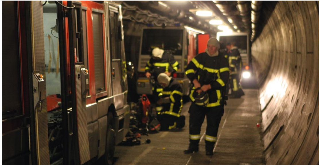
500 French and 211 UK firefighters were involved in the September incident, where temperatures were close to intolerable